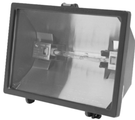
Suitable for wet locations Lamp included