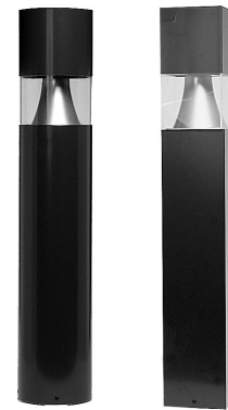
Suitable for wet locations Lamp included

An Alzak finished aluminum parabolic reflector located in the top cap redirects the light downward where the finished aluminum cone shaped reflector evenly spreads the light down and out in a symmetrical pattern below eye level.